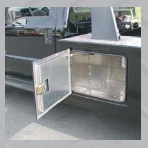
14 cubic foot tool box