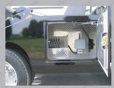
Enclosed manual controls